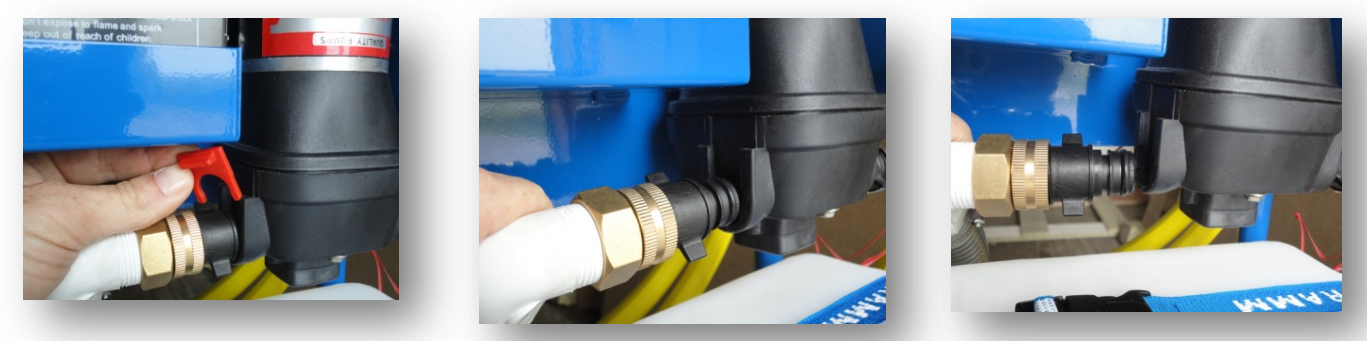
Remove locking pin