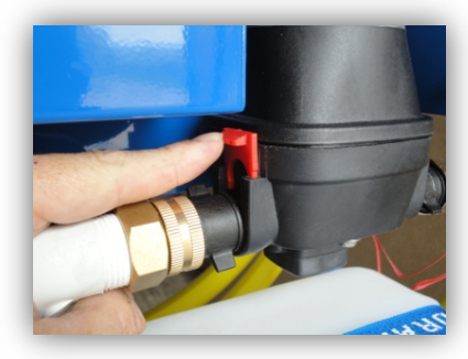
Lift locking pin