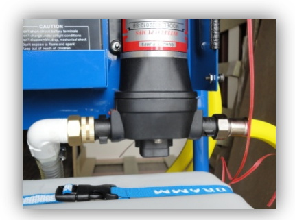
Pump and hoses assembled